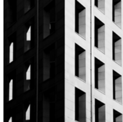
Architecture: Kamilla Hanapova