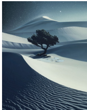
Landscape: Benjamin Everett