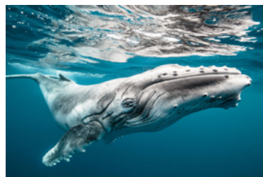
Wildlife: Karim Iliya