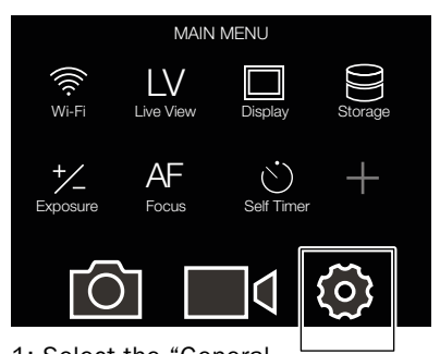
1: Select the "General Settings Menu" from the main menu.

Copy the downloaded file (H6D v1 21 0.cim) to the memory card and insert it into the camera. Then follow the procedure below: