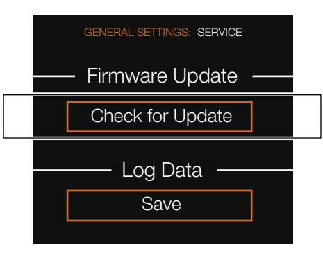
3: Click "Check for update" and select the file "X-Lens_v0_5_40.cim" from the list. Finally click "Upgrade".