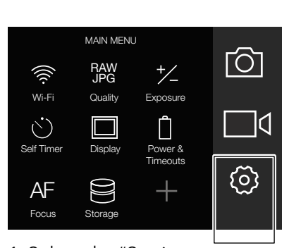
1: Select the "Settings Menu" from the main menu.

Copy the downloaded file (X-Lens_v0_5_40.cim) to the SD card and insert it into the camera. Then follow the procedure below: